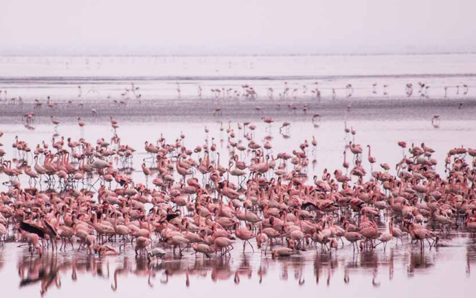
Flamingos in Kenya Spectacular view of Flamingos at Lake Nakuru and Lake Naivasha.